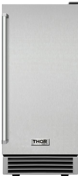
Product: 15 Inch Built-In Ice Maker in Stainless Steel Model Number: TIM1501